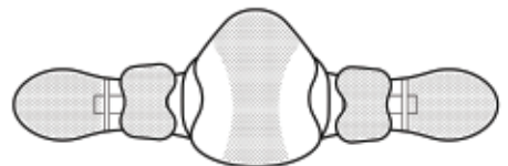
L0637 / L0650 With additional back and side panels

Scope of application: prophylactic back protection, disc degeneration, fibromyalgia, lordosis, lumbago, lumbar disc displacement, lumbosacral spondylosis, mild spinal kyphosis, muscular weakness, post-surgery spinal stabilization, scoliosis, spinal stenosis, sprains and strains, among others