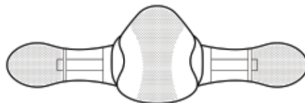
L0631 / L0648 With additional back panel