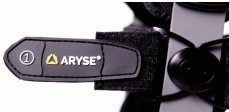
USER-FRIENDLY NUMBERED STRAPS

Scope of application: cartilage/meniscus tears, chondromalacia of the patella, fractures of the patella, fractures of the tibia and/or fibula, knee instabilities, knee ligament derangement, multiple sclerosis, osteoarthritis, rheumatoid arthritis, valgus and varus knee corrections, among others