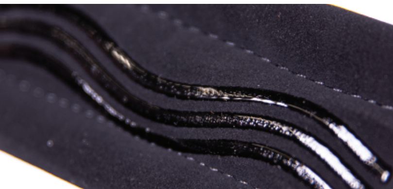
MIGRATION PREVENTION GRIP