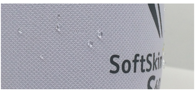
5. BWith successful activation of the micro-pores, water drops will leak on the outside.

Do you need more assistance or do you have further questions?