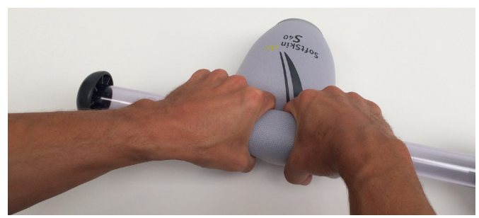
1. Roll the liner several times from different sides onto the liner