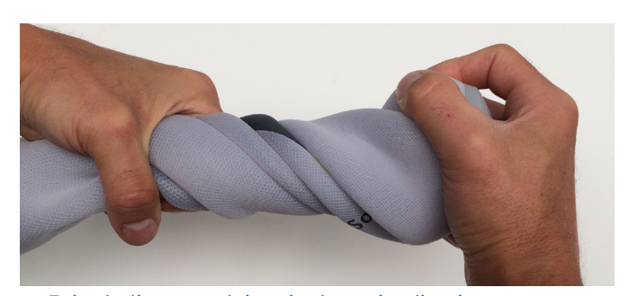
2. Twist the liner several times in alternating directions.